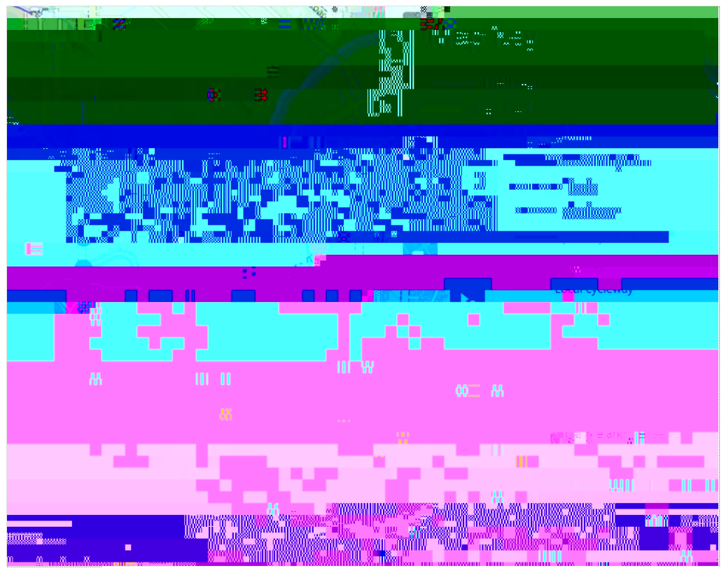
Figure 5: Map of Beckenham from openstreetmaps with dots representing places with vehicle access (in blue) and places with cycle and pedestrian access.

Figure 5 shows that there are multiple places where cars and cyclists can enter and exit the Beckenham loop from other suburbs. The blue dots on this map represent vehicles' access points, with the majority being at the far end of the river loop near Tennyson Street. The yellow dots on this map represent the access points only cyclists and pedestrians have, all within the river loop's closed end. Cyclists can also use the blue vehicle access points. Therefore, cyclists have more access to get in or out of the Beckenham loop than cars, especially when crossing the river. Therefore, the traffic is influenced by filtered permeability, with a more connected grid for cyclists and less access to cars. This can cause less traffic congestion within the loop and more people choosing to cycle due to convenience. A statement by a male participant during the second focus group supported this concept that the river loop was causing filtered permeability: